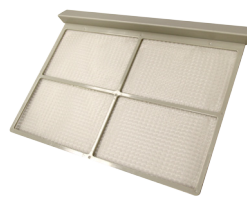
Washable and Reusable Particulate Air Filter