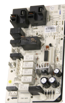
Main Control Board