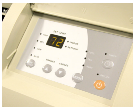
Touch Pad Control with Digital Display