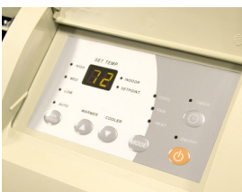
Touch Pad Control with Digital Display