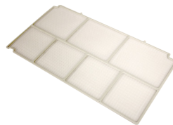
Washable and Reusable Particulate Air Filter