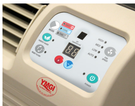
Touch Pad Control with Digital Display