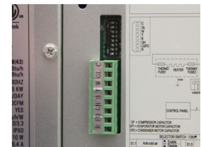
Energy Management & Thermostat Connections

YMGI Group 601 Arrow Ln, O'Fallon, Missouri 63366 Phone: 1-866-833-3138 Fax: 1-866-377-3355 ymgigroup.com