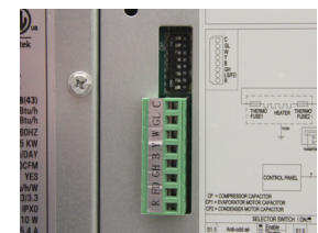
Energy Management & Thermostat Connections