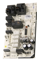
Main Control Board