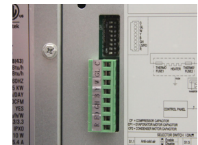
Energy Management & Thermostat Connections

YMGI Group 601 Arrow Ln, O'Fallon, Missouri 63366 Phone: 1-866-833-3138 Fax: 1-866-377-3355 ymgigroup.com