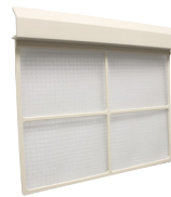
Washable and Reusable Particulate Air Filter