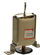
Condensate Anti-freeze Drainage Valve