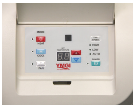
Touch Pad Control with Digital Display